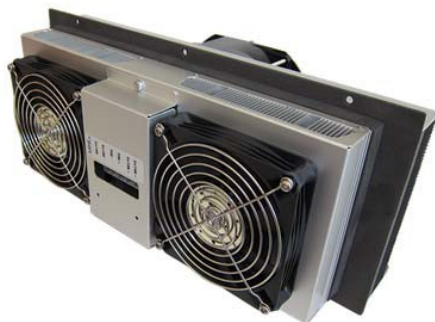
AA-230 Outdoor Cooler

In addition, the AA-230 and AA-480 Series have been designed to pass rigorous Telcordia test requirements, such as earthquake resistance, salt fog, wind-driven rain, high temperature exposure and dust contaminants. This is due to the selection of world class components such as brand fans with the highest degree of environmental protection and lifetime guaranteed waterproof connectors, heavy duty anodization on the high-density heat sinks, overheat protection, and double environmental seals for the thermoelectric coolers.