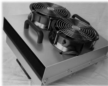
AA-480 Outdoor Cooler