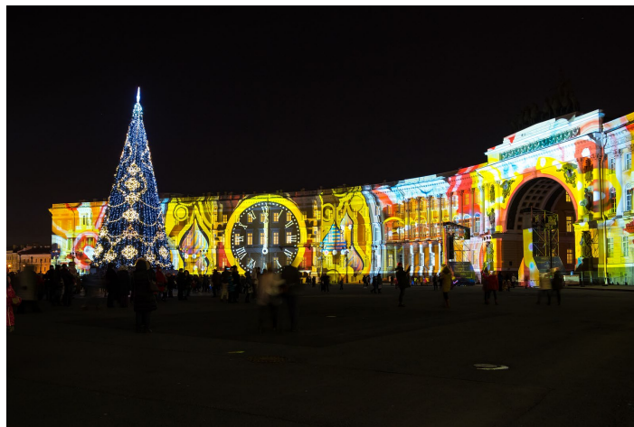
Laser projectors used for outdoor light shows require precise temperature control to ensure high-resolution image generation.

Laser projectors used for entertainment applications utilize laser modules to generate 4K-resolution images with a robust color palette and up to 75,000 lumens. While commercial laser projector systems quickly have evolved to be more energy-efficient, these systems still require up to 6kW to generate bright, high-resolution images. This is needed to project in cinemas and large venues at stadiums. Consequently, the high-power laser systems generate a significant amount of heat during operation. Heat can degrade the sensitive laser components, including the laser module (laser diodes and laser optics), optical scanning system, and laser diode driver electronics. These systems need stable temperature control to ensure proper functionality, long life operation and crisp image projection. Efforts to increase luminance and color palette resolution while maintaining the size of a laser projector have led to significant thermal challenges for many manufacturers. Depending on the type of laser projector, temperature control can be maintained by a recirculating chiller or an ambient liquid cooling system with a thermoelectric cooler.