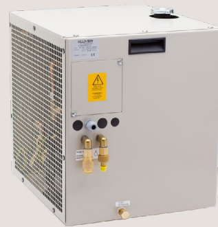
High heat capacity