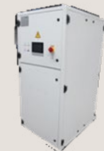
Higher efficiencies than air-based heat transfer mechanisms