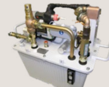
Superior Heat Routing